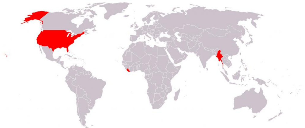
The grey colored countries use the metric system

Maateenheid (metric system): miles are 'kilometers'. Square foot is 'vierkante meter'. Gallons are 'liters'. Fahrenheit is Celsius. Foot is 'centimeters'. Everything is different (and for sure difficult) It will drive you nuts.