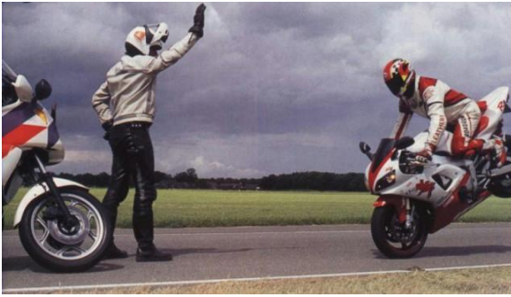
Maybe this isn't a good idea, even in the Netherlands.